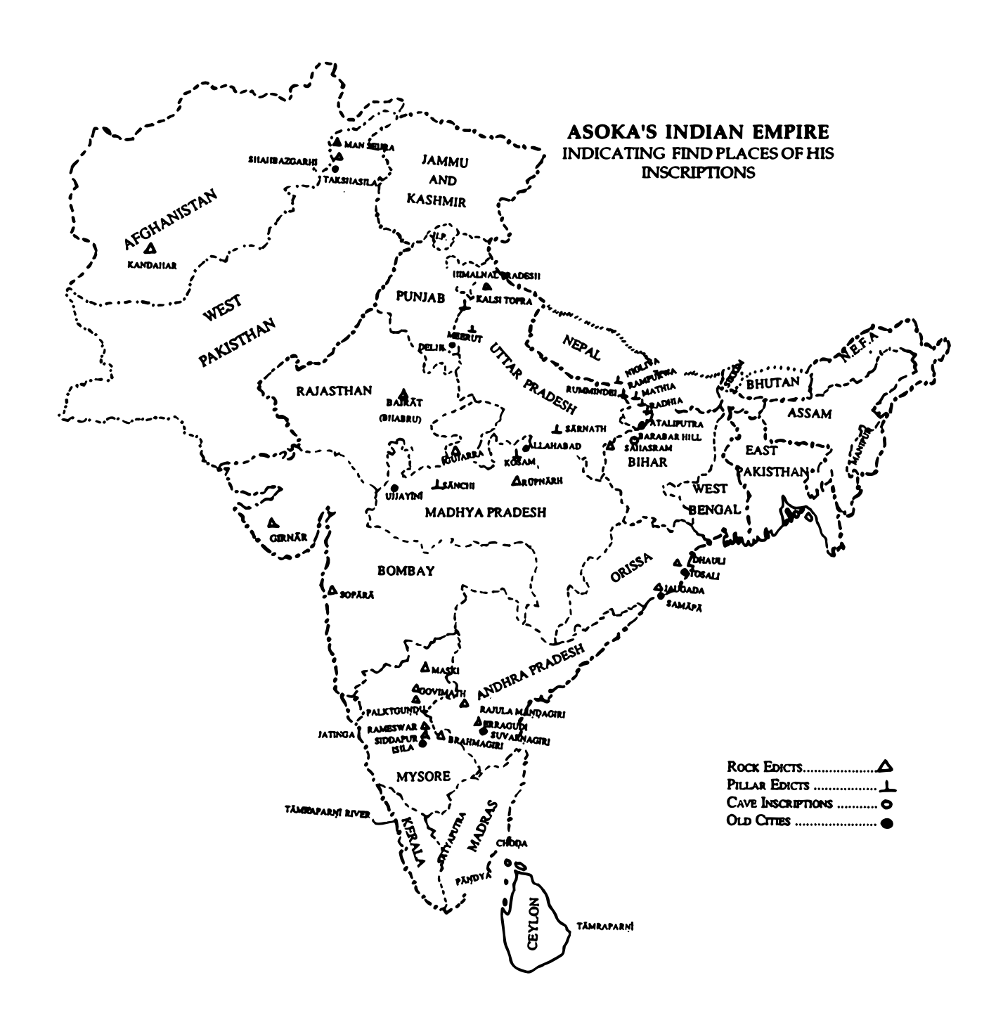
Aśoka's Indian Empire