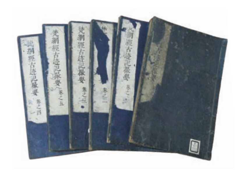
Above: Vol. 1, Combined Text of the Beommangyeong gojeokgi . (Property of the National Central Library)

Below: Bonmōkyō koshakki satsuyō. (Property of Dongguk University Museum)