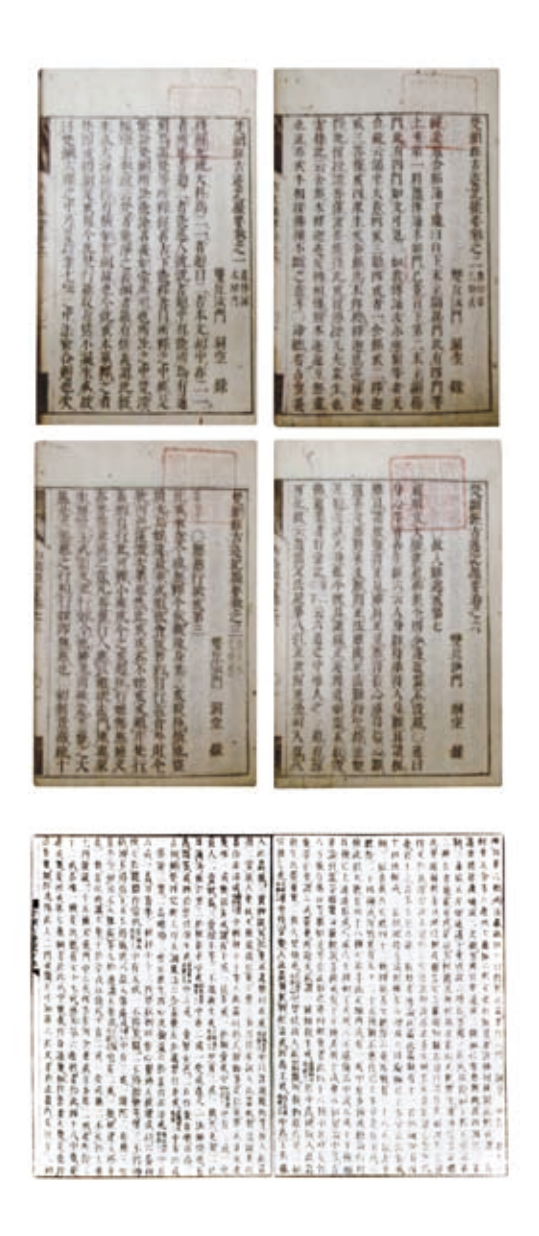
Above 2 pictures: Text of the Bonmōkyō koshakki satsuyō . Below: Beommangyeong gojeokgi , text from the end of the first roll. (Property of Japan National Diet Library)